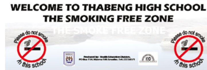
Lesotho Network on Anti-Smoking poster used in schools

The programme is reported to have been successful – 62 per cent of children at the schools have received counselling and access to resources to help them quit, and over the decade that the initiative has been in place, about 20 per cent of young smokers reached by the initiative have managed to kick the habit. The next step planned is to expand to all schools across the country.