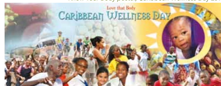
Know Your Body poster, Caribbean Wellness Day 2010

Most countries have begun evaluation of the CWD, including budget, participation rates and plans for sustaining the activities, which is essential if long-term health benefits are to be achieved. Many countries have used the Day as a catalyst for the creation of year-round programmes – such as the 'Family Fitness Sundays' established in Diego Martin, Trinidad and Tobago, in which roads are closed for four hours to provide space for people to socialise, dance and eat healthy food – and others, such as St Lucia, have introduced physical activity in primary healthcare centres.