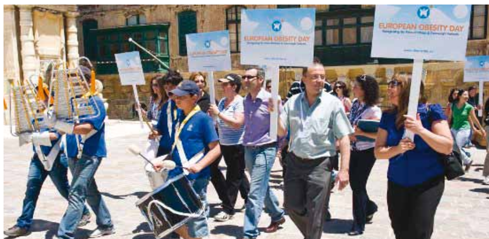
Launch of the campaign on National Obesity Day

Malta, with a population of around 409,000 (2009), is facing an obesity epidemic. Obesity rates among adults, at 22.3 per cent, are the third-highest in Europe; overweight/obesity is currently at 29.7 per cent among children – no other country in Europe has a rate over 20 per cent. 61 In response to this urgent health threat, Dr Joseph Cassar, Minister for Health, the Elderly and Community Care, launched a €150,000 campaign on European Obesity Day 2010: Piż Tajjeb għal Hajtek! (Healthy Weight for Life!) . 62