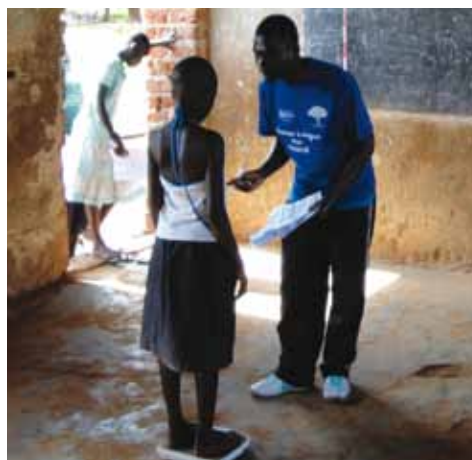
Registering for a football team

‘I have learned some soccer skills, like fair play, and about my rights and ways to solve conflicts’