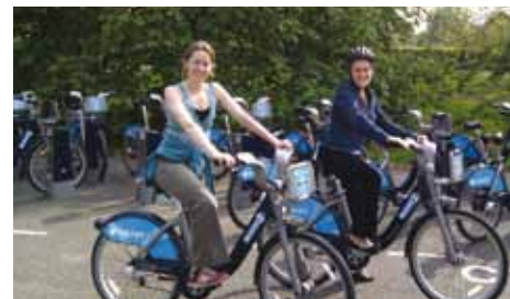
Using London's new cycle-hire scheme