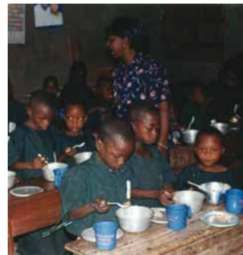
Children preparing a healthy meal

The school feeding project was launched in December 2006, following a seed grant from the Federal Government of Nigeria to Osun State – and is ongoing today (2011). The cost of feeding each child is currently around N23 a week (US$0.15), and is funded by the state government and local governments, covering materials and operational costs. The children are educated about the importance of good nutrition (see photo) and sanitary practices, so that they can take what they have learned back to their families. The initiative may also increase the level of education reached by the children, as the offer of a free school meal increases enrolment in school: the Osun State Special Adviser suggested in 2010 that school enrolment has as much as doubled.