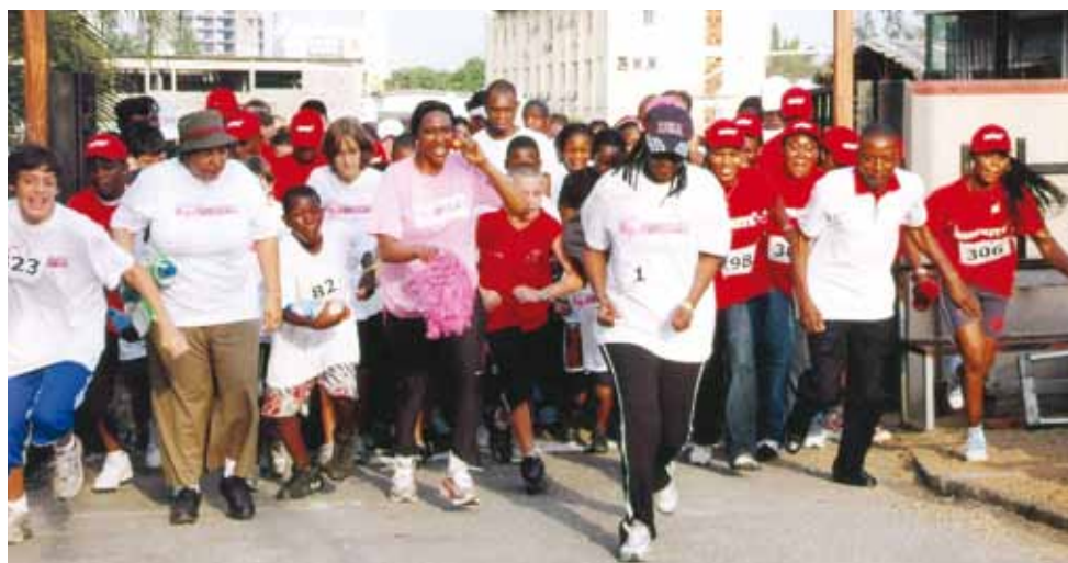
The start of the 2010 Run

The 'Run for a Cure' initiative, held annually since 2009 in Lagos, Nigeria, is a fundraising and awareness-raising event that brings together two key aspects of tackling breast cancer: physical activity and early detection. Physical inactivity is a risk factor for many cancers, with a risk reduction for breast cancer of approximately 20–40 per cent for those who do vigorous physical activity for 30–60 minutes on five days each week. 30