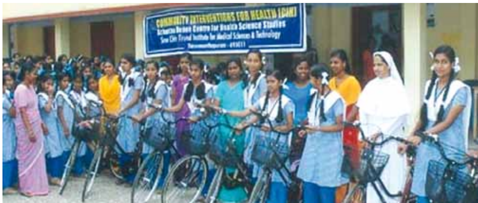
Girls begin their bicycle training in schools

Trivandrum, Kerala, in India, is the site of an ongoing project to assess the health impacts of a range of interventions on diet, physical activity and tobacco use in schools, healthcare centres, workplaces and the community in local rural villages. It is part of the Community Interventions for Health initiative – a project that compares the effects of taking action on the major risk factors across five different countries. 54 Each country project consists of an intervention site and a control site, so that the effects of the interventions can be compared.*