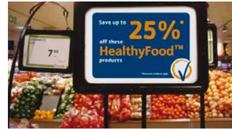
Discount at Pick 'n' Pay