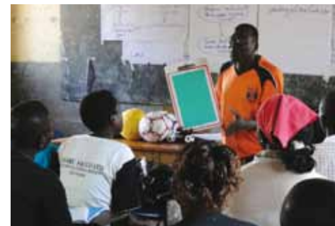
Training the coaches

The project is designed to be sustainable – local staff are planning to launch the next season with minimal external management support, and OA Projects (while continuing to fund the project in 2011) is working towards complete local ownership with financial and logistical support from local government and community groups.