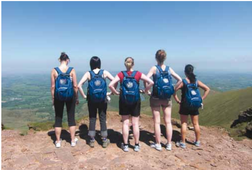
GCC participants out and about

The Global Corporate Challenge (GCC) 25 is a rapidly growing organisation that has developed and established an annual four-month physical-activity challenge for employees. Started in 2004 in Australia, the organisation has now helped encourage over 250,000 employees in more than 2,300 of the world's companies across 65 countries to improve their lifestyles.