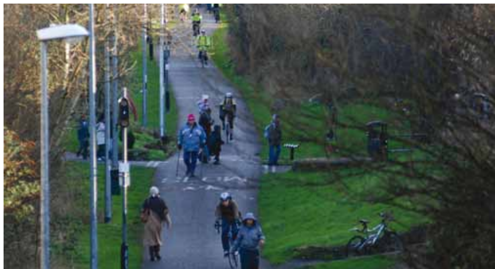
One of the National Cycle Network's dedicated walking and cycling paths

In England, the need for ‘active travel’ – walking and cycling – to be included in strategies to tackle obesity and NCDs is explicitly recognised by the government: the 2010 White Paper on public health states that ‘active travel and physical activity need to become the norm in communities’. 32 Currently, only 39 per cent of men and 29 per cent of women build the recommended amount of physical activity into their everyday lives. 33