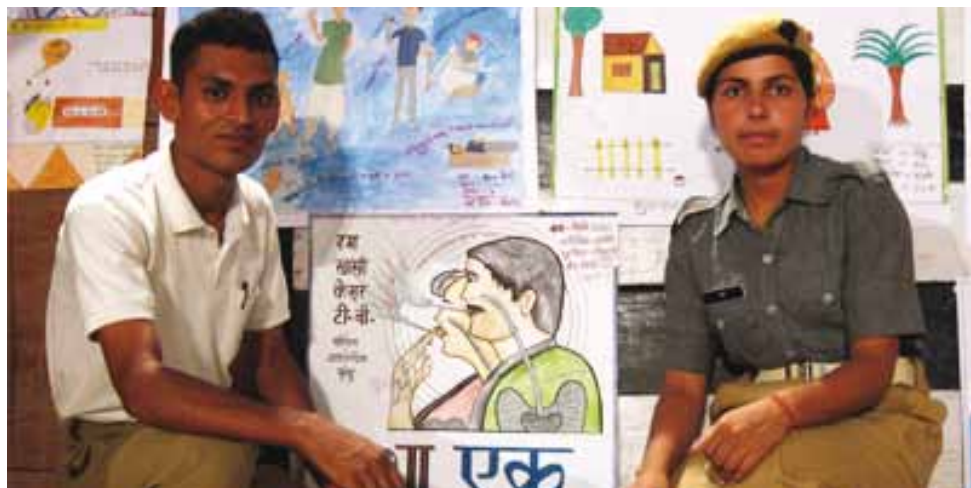
No-smoking posters in the Rajasthan Police Academy